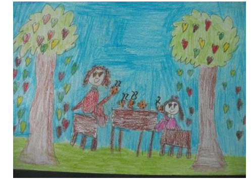
A hopeful drawing on school education where love hearts fall from the trees