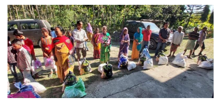
Also on the Andamans (in the Bay of Bengal in the

Indian Ocean, nearly 3000 kilometers south of Cooch Behar), the SB Foundation could spread Christmas joy. In spite of the Corona restrictions 65 persons were permitted to attend the Christmas service, where a small family choir sang. Afterwards Christmas presents were handed out and a Christmas meal served.