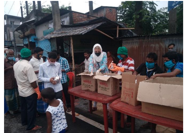
The premises of the School for Blind Students are used for cooking and preparation of food packets which are distributed by the school staff in a poor area.