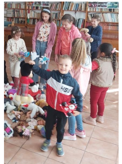
Look what I found - Mickey Mouse!

But we must not forget the needs of the villager.