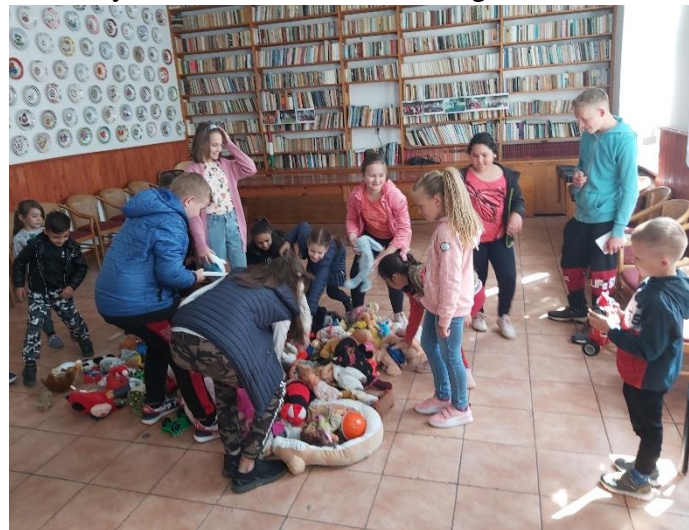
The joy and excitement are unmistakable.