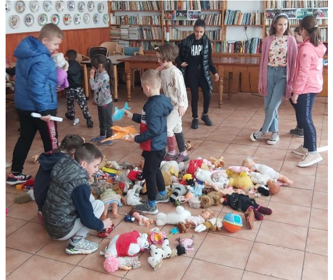
What an abundance of toys from Sweden for the refugee children to choose from. An Eldorado!