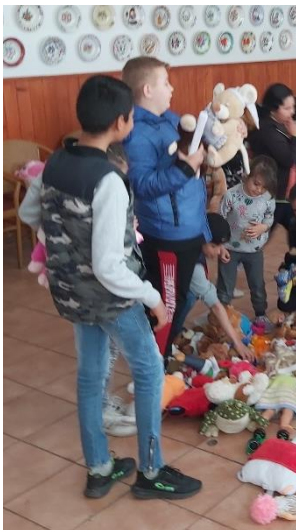
A teddy bear!