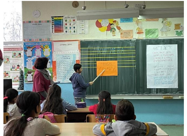
The nurse is introduced.