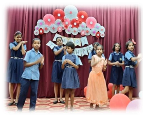
Here the students celebrate "World Teachers' Day" (October 5)